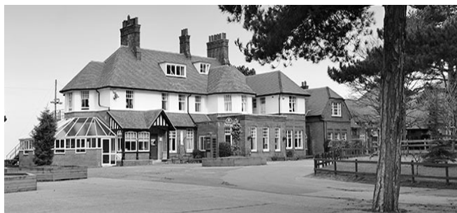
Kingswood Activity Centre, West Runton

On Wednesday 28 th April we had a long journey to West Runton, Norfolk. We were travelling to a Kingswood centre to spend 3 days doing fun activities. When we arrived we were lucky that the sun was shining so we could visit the beach. Everyone quickly ate their lunch so that we could play on the beach and have an ice-cream. Some people played rounders, others played football and some brave children searched for crabs! We were very excited to find out where we would be sleeping. Our first task was to make our beds! (But the adults actually ended up doing most of them!).