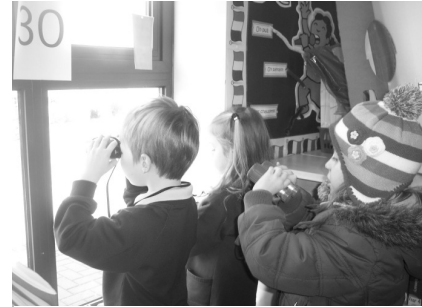
Pupils birdwatching for brainboost!