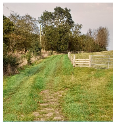
Part of the byway that passes through Faxton, seen from Mill Lane.

The site is listed by Historic England and is considered important as it has the potential to help increase our knowledge of the life and times of a rural settlement within the wider medieval landscape.