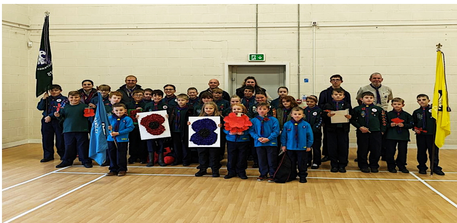
Photo: Some of our young people and adults preparing for Remembrance Service outside TCAM

As always if you have any children that wish to join our Group - Scout Troop (10 1 / 2 -14 years), Cub Pack (8-10 1 / 2 years of age) or Beaver Scout Colony (5 3 / 4 -8 years of age) drop an email to mawsleyscoutgroupenquiries@gmail.com . We are always looking for adult supporters whether it be as a Leader, regular helper, or providing services as a Trustee. We would love to open a new Squirrels section (for boys and girls aged 4-5 years) but would need a leadership team of 3 adults to get this up and running. Any takers?