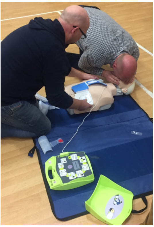
minutes of a cardiac arrest the survival rate jumps from around 6% to 74%.

Mawsley FC were keen to get involved and together with support from TCAM and the Northants Search & Rescue Volunteers who very kindly provided the training, 12 coaches were able to practice their CPR training and learn how to use different types of Defibrillators. Of course everyone hopes that they will never have to use their training in a real life emergency but the more people who are trained in using the AED device then the greater the chance of a happy ending.