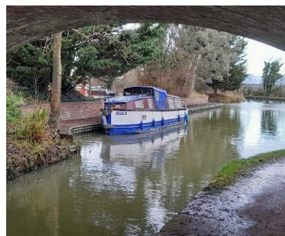
The Grand Union Canal

There is still much to discover and many new byways, bridal ways, and footpaths to walk. The county is also well placed for journeys to other parts of the country – without having to flog round the M25.