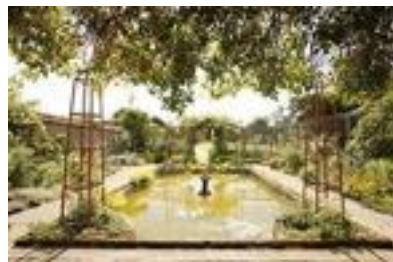
Photos of Lamport Hall gardens

The 16th August saw 17 of us gathered again to visit 4 gardens in Mawsley. It is quite amazing how different gardens can be created in such relatively small spaces. We all went away with some fresh ideas for our own. Again, so lucky with fine weather and lively, friendly chat.